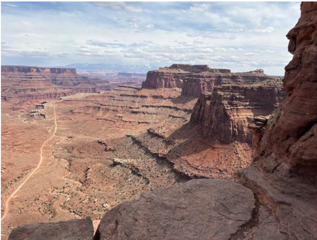
A View from the top at Canyonlands National Park