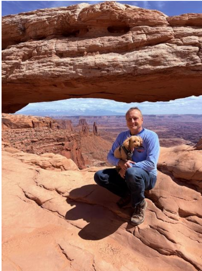
Arches National Park