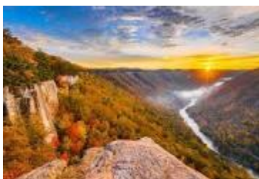
West Virginia in the Fall!