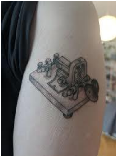
W0GXQ's new tattoo!