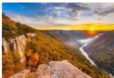
West Virginia in the Fall!