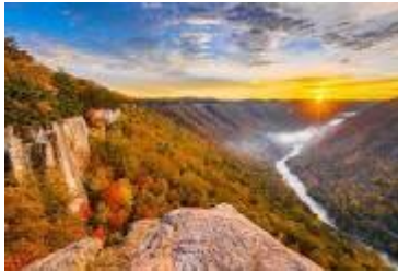
West Virginia in the Fall!