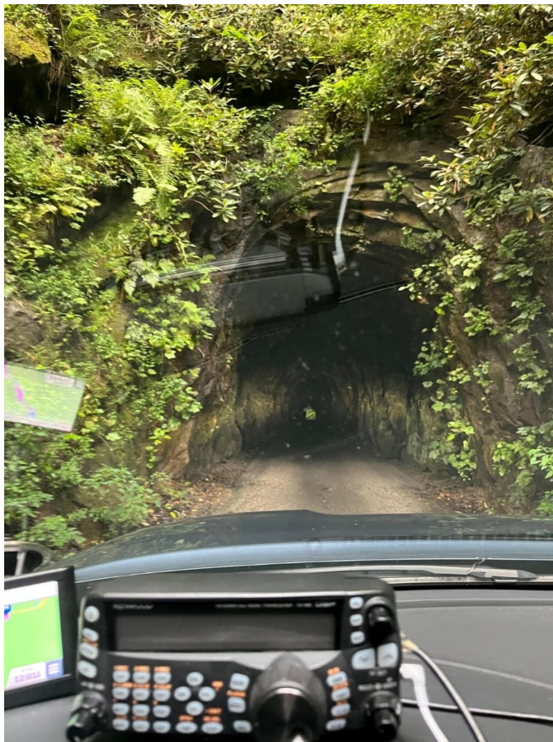
Entrance to Bat Cave!