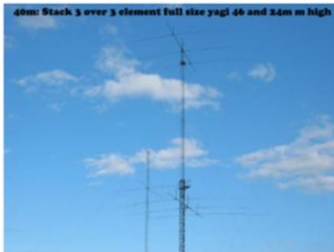
40m: Stack 3 over 3 element full size yagi 46 and 24m high