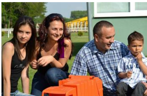
OM2VL and family.