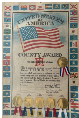
USA-CA # 1270