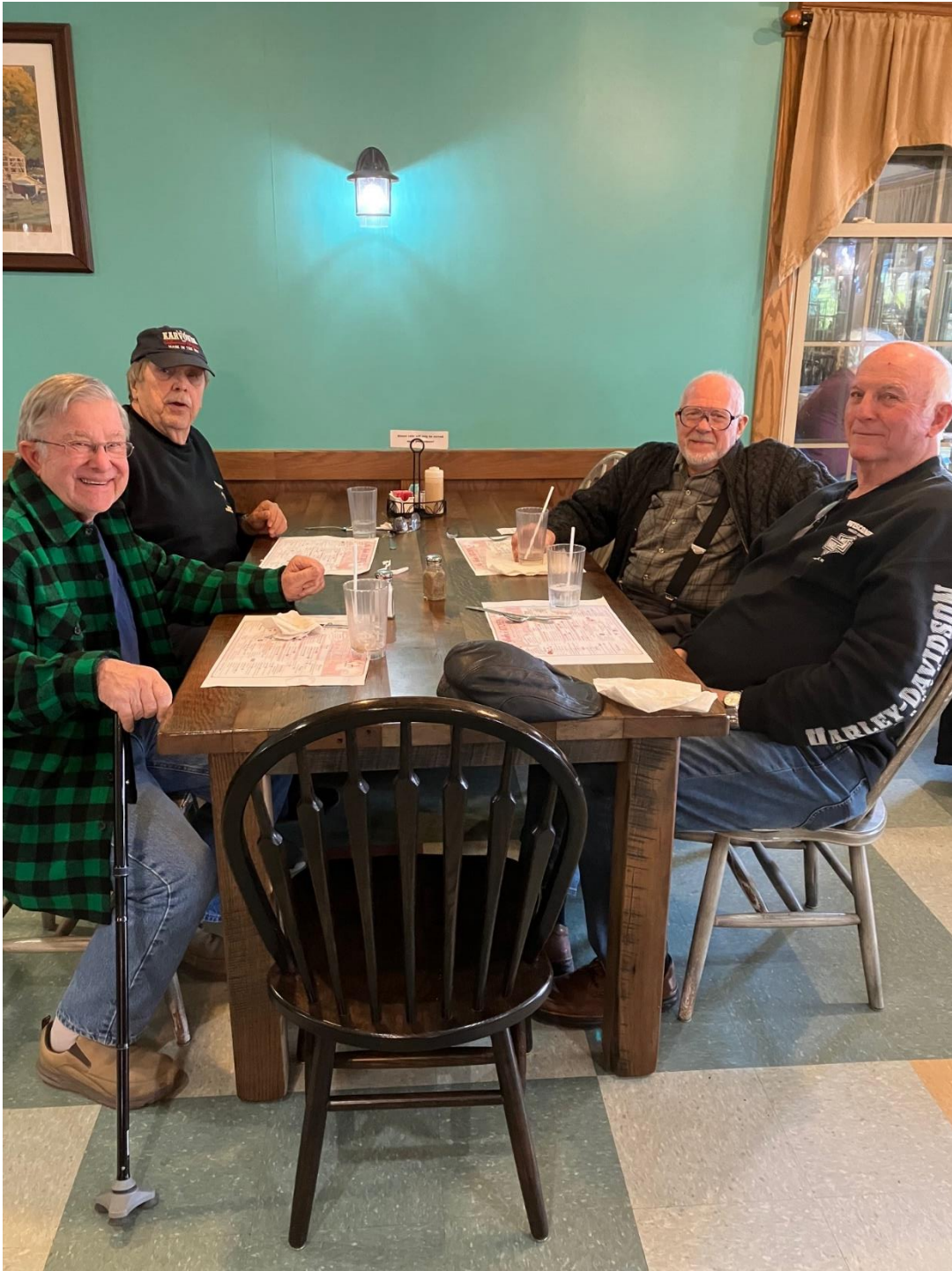
K8ZZ, K8MFO, K8CW, W8NW