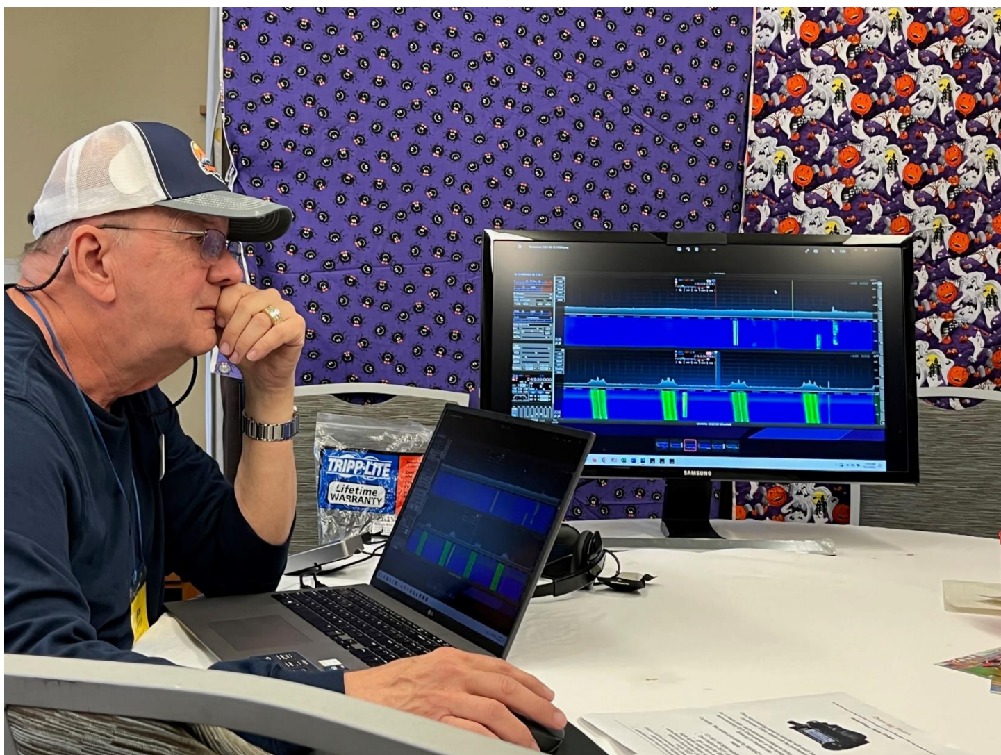
Ron N5MLP Presentation on FLEX