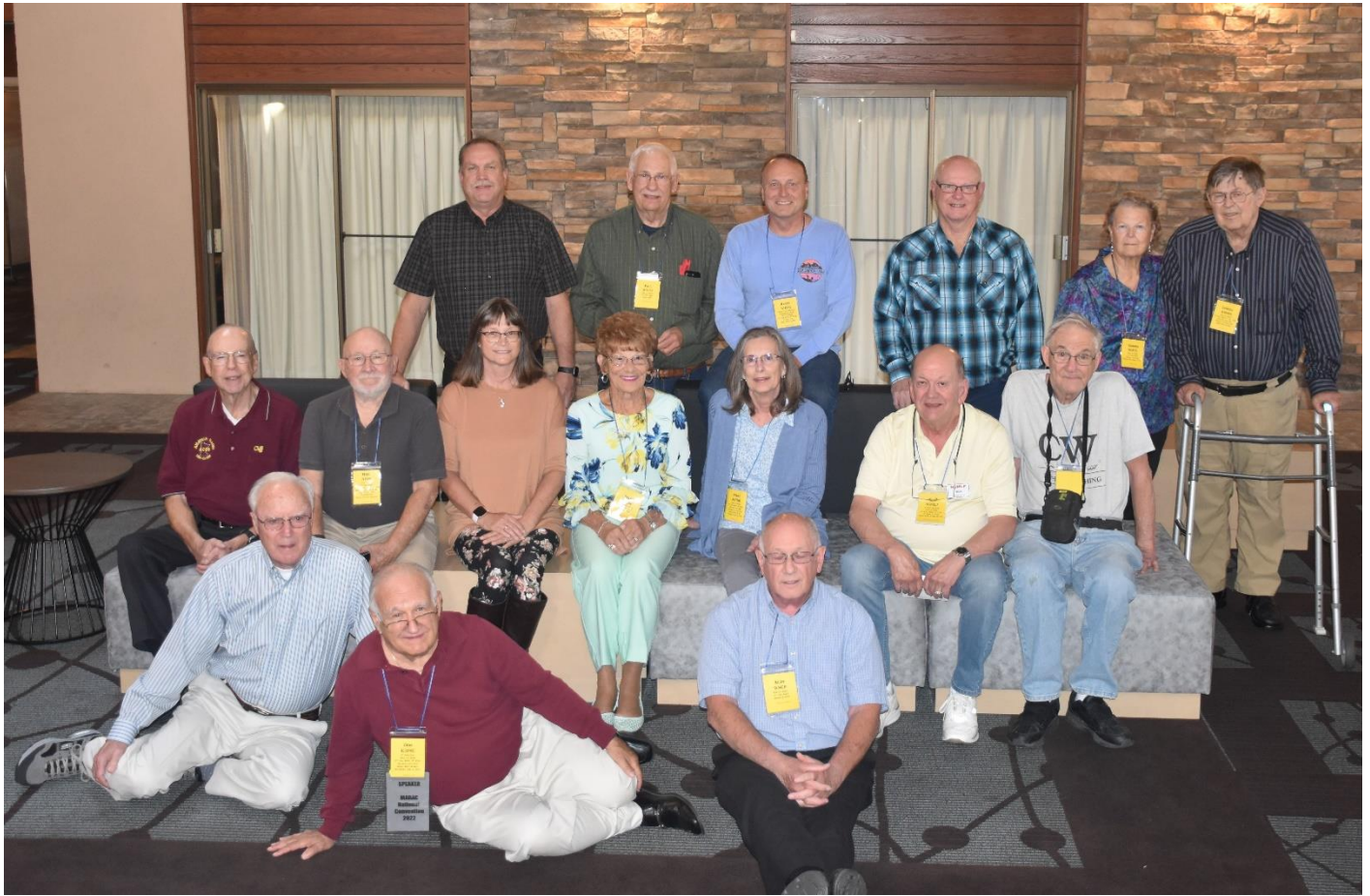
USA-CA Award Holders