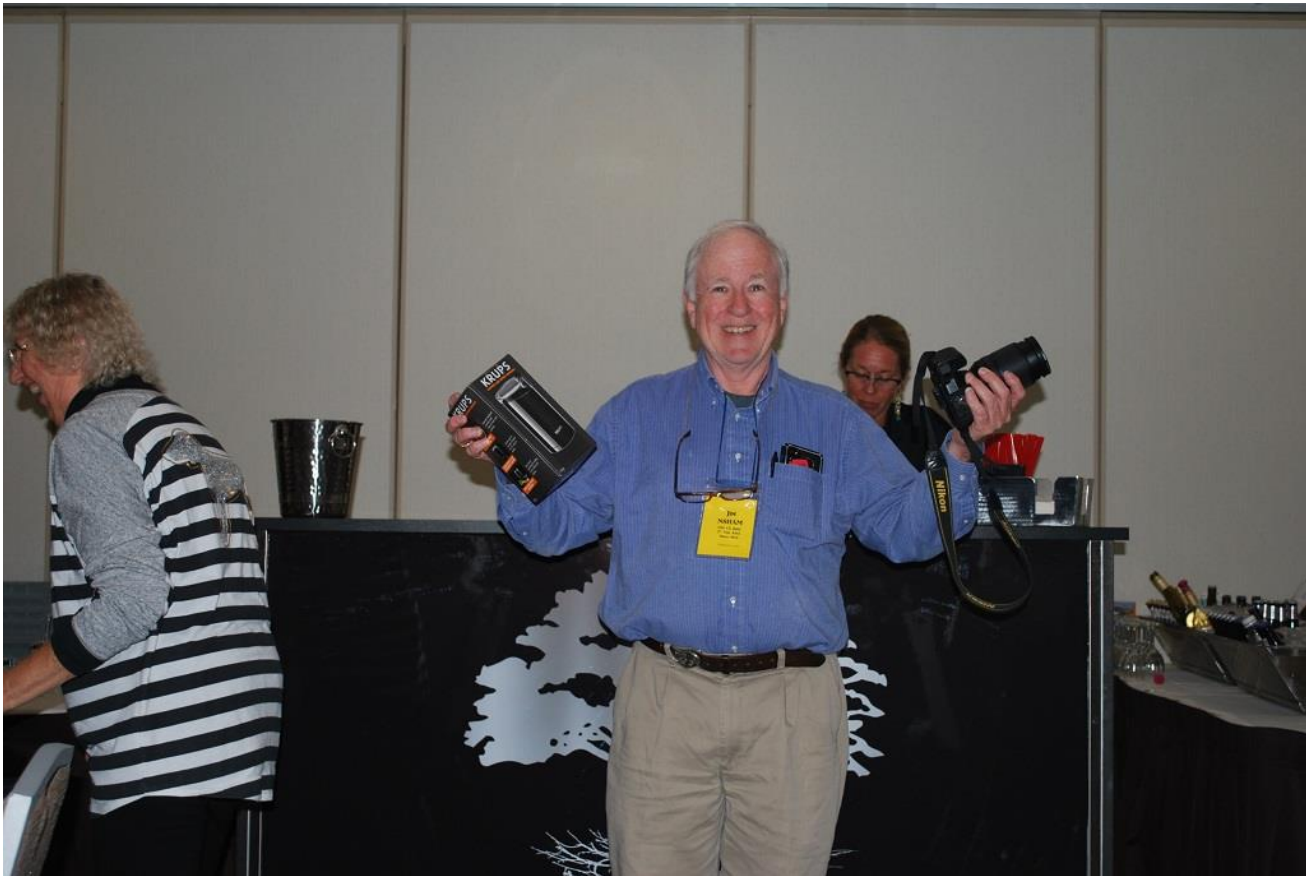
N8HAM, Another winner!