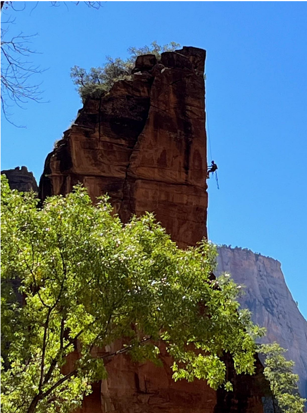
Someone trying to activate a new Park!