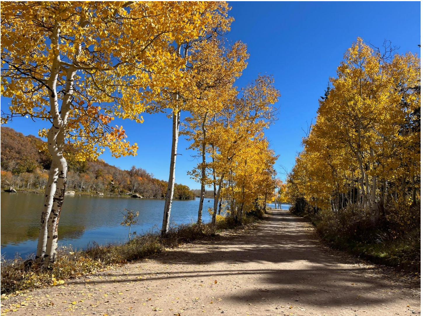
Beautiful Fall Colors