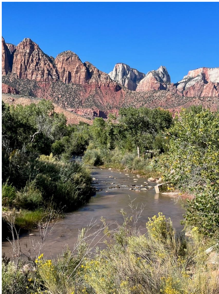
Zion National Park