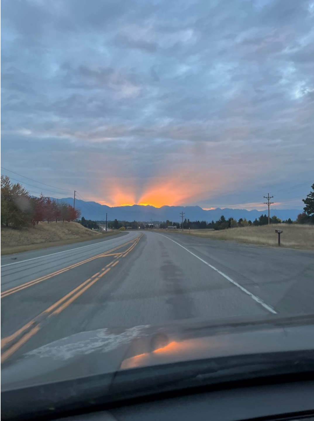
Early morning near Glacier National Park