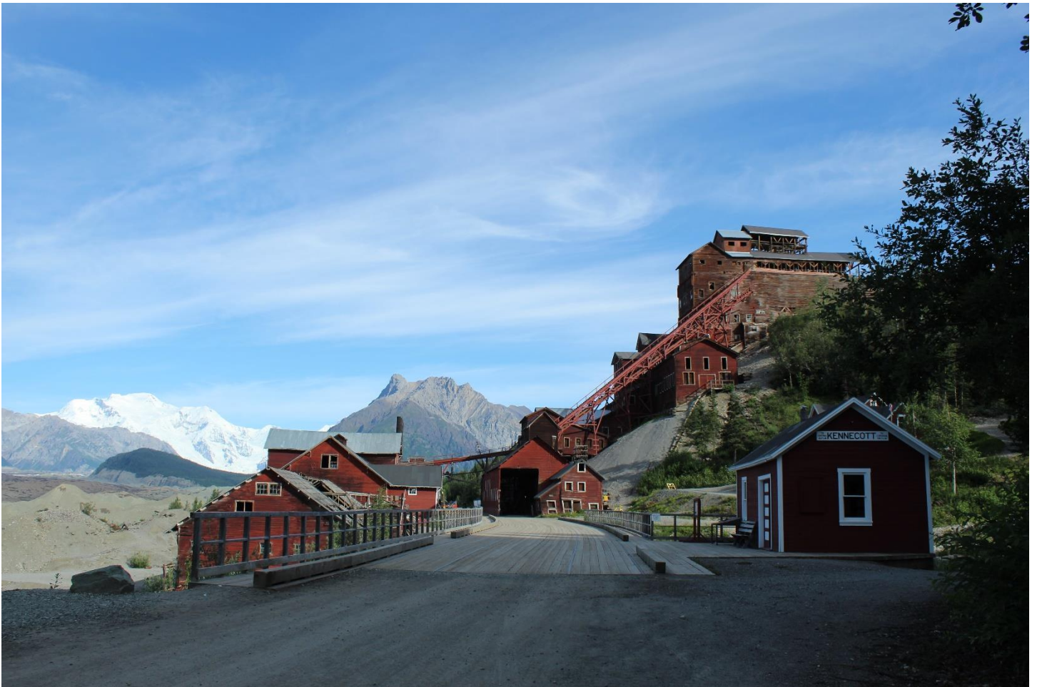
Kennecott mine complex