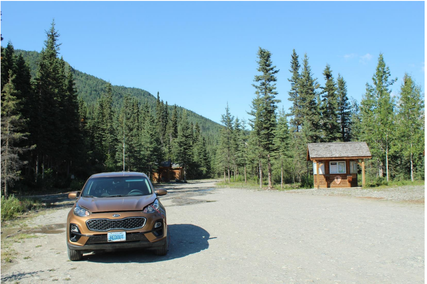
Mobile setup location