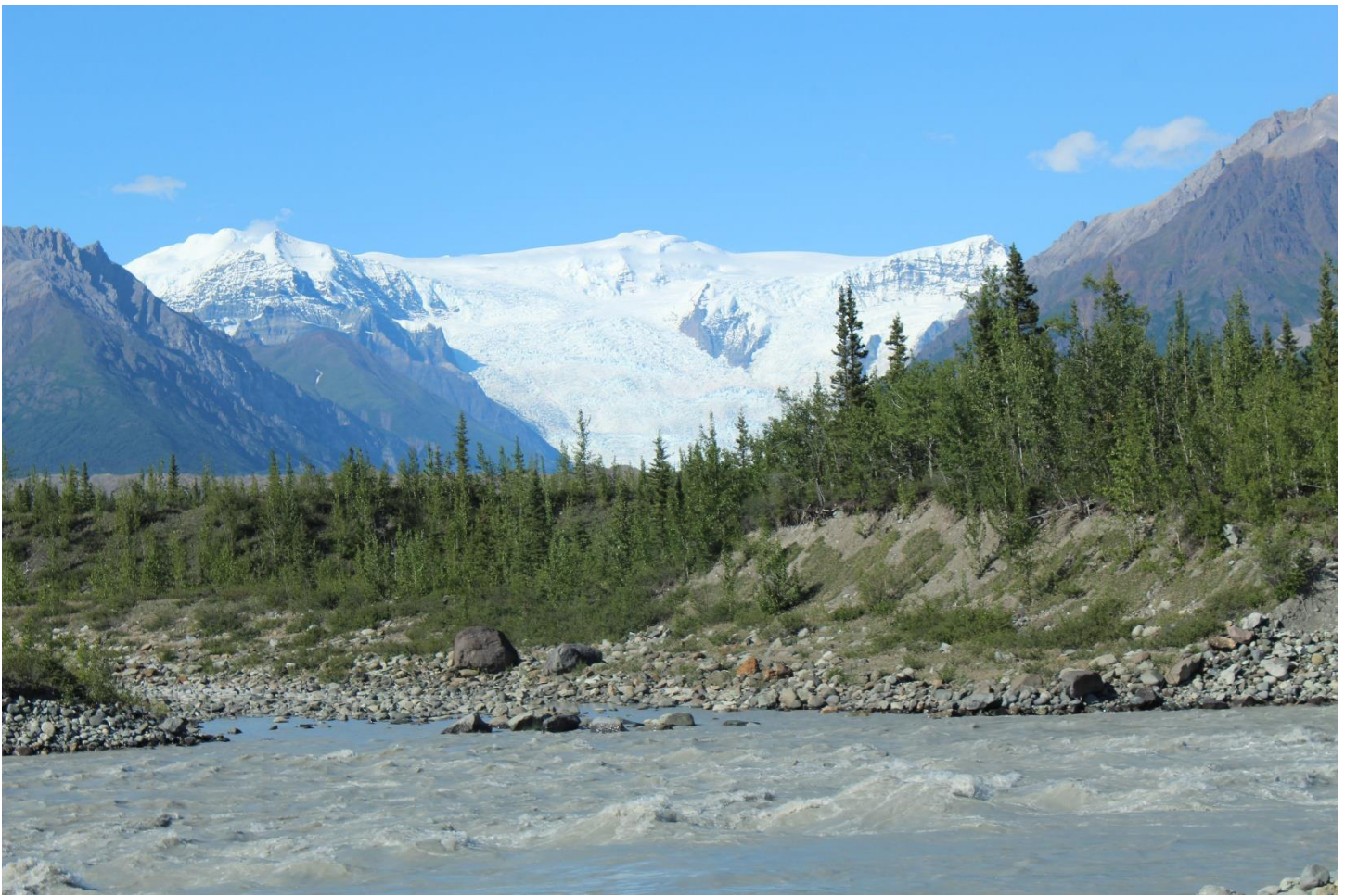
Kennecott River and glacier