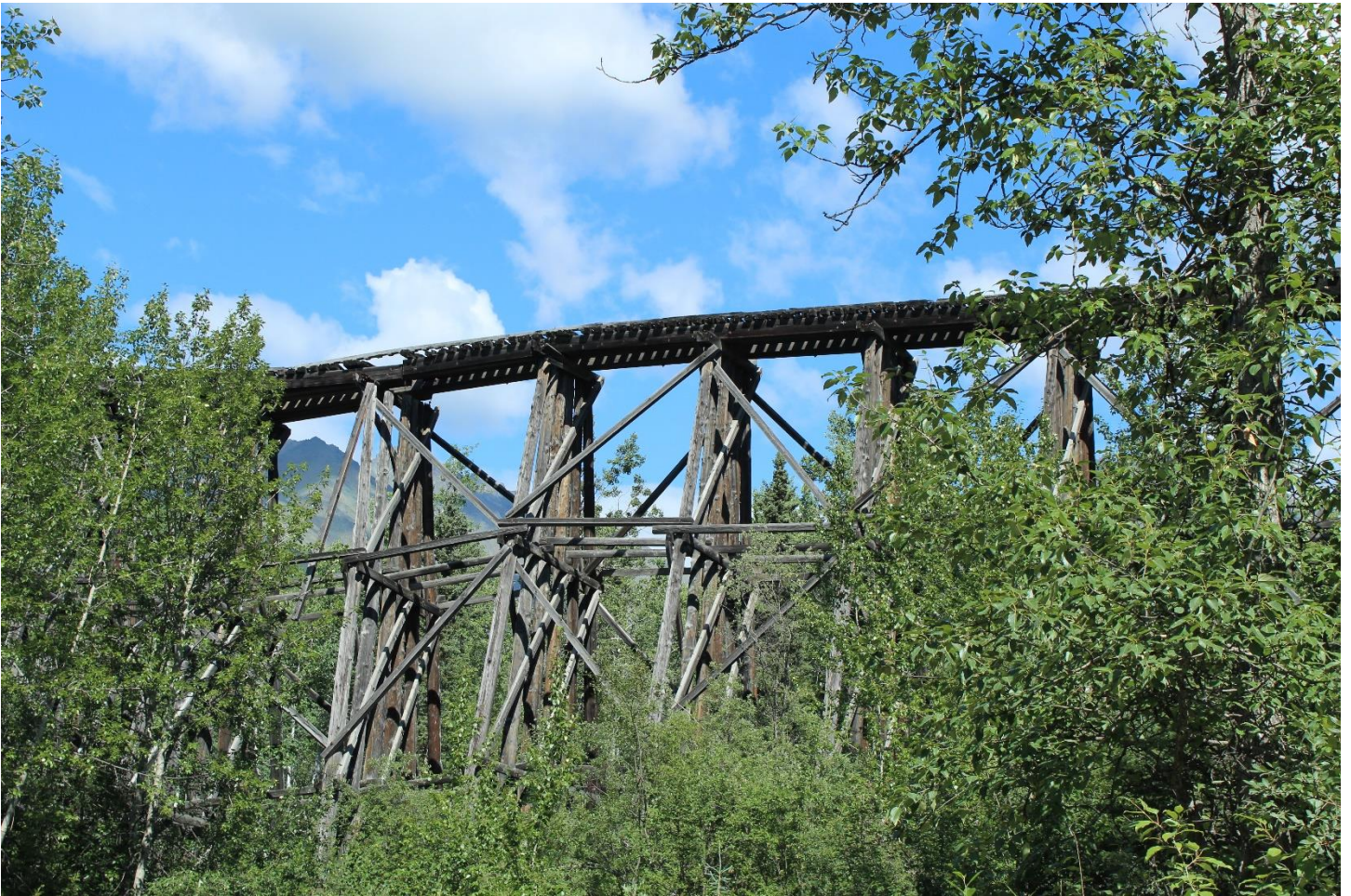
One of the many CR and NW railroad trestles