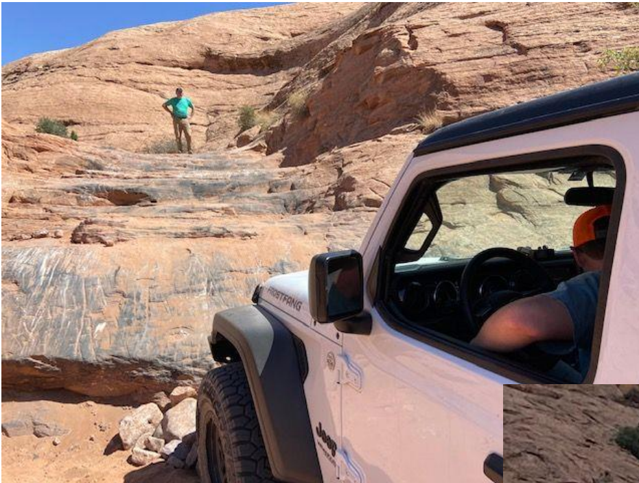
Going up a rock “waterfall” south of Moab, Utah

While I did not have a rig in the jeep it definitely was an adventurous “mobile trip”! Here are a few pics: