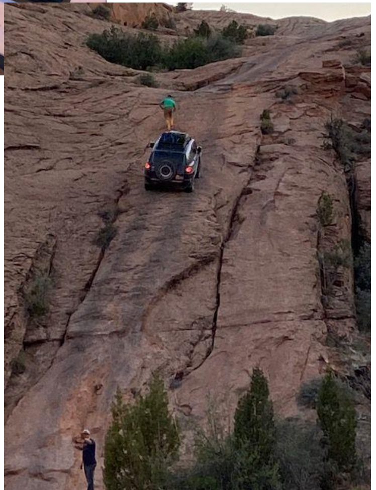
Heading up a 32 degree incline!