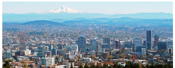
A View of Portland and Mt. Hood