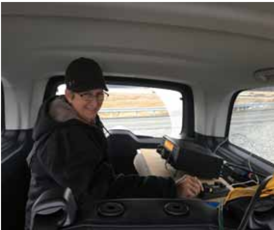
(AG6V operating portable from the van)