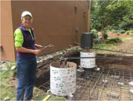
(AG6V ready for the concrete pour for the tower)

Mobile operation has now started to draw me, and I've got an evolving portable setup in the van. I'm starting to put out counties during road trips to cities where there are running events, which is my other passion.