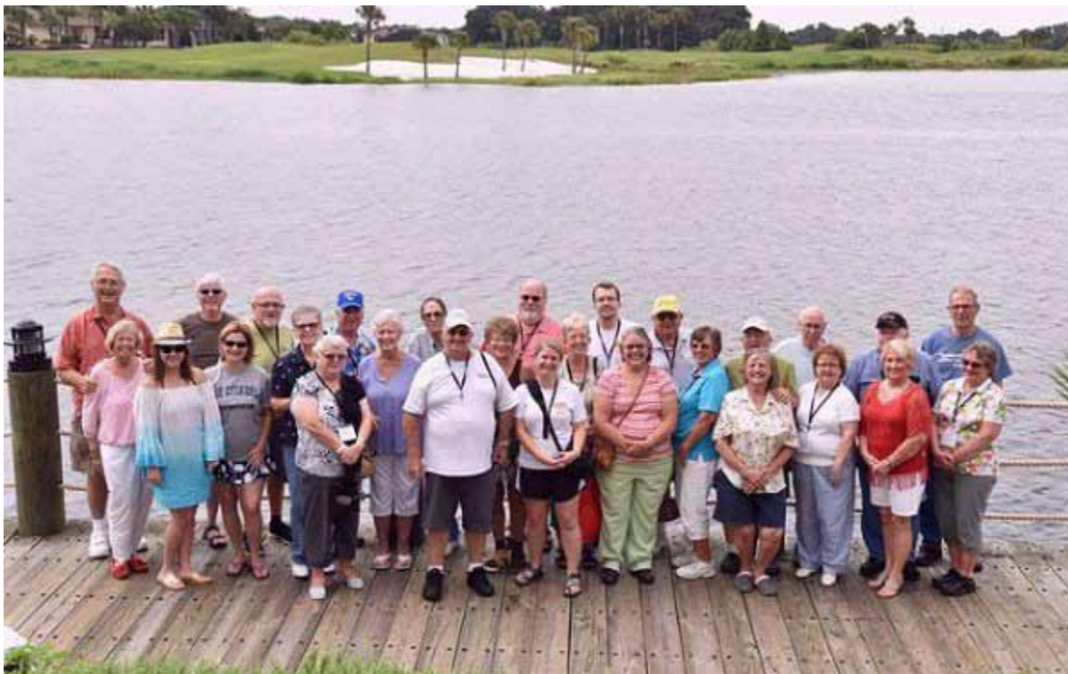
Attendees of the 2015 National Convention at The Villages in Florida