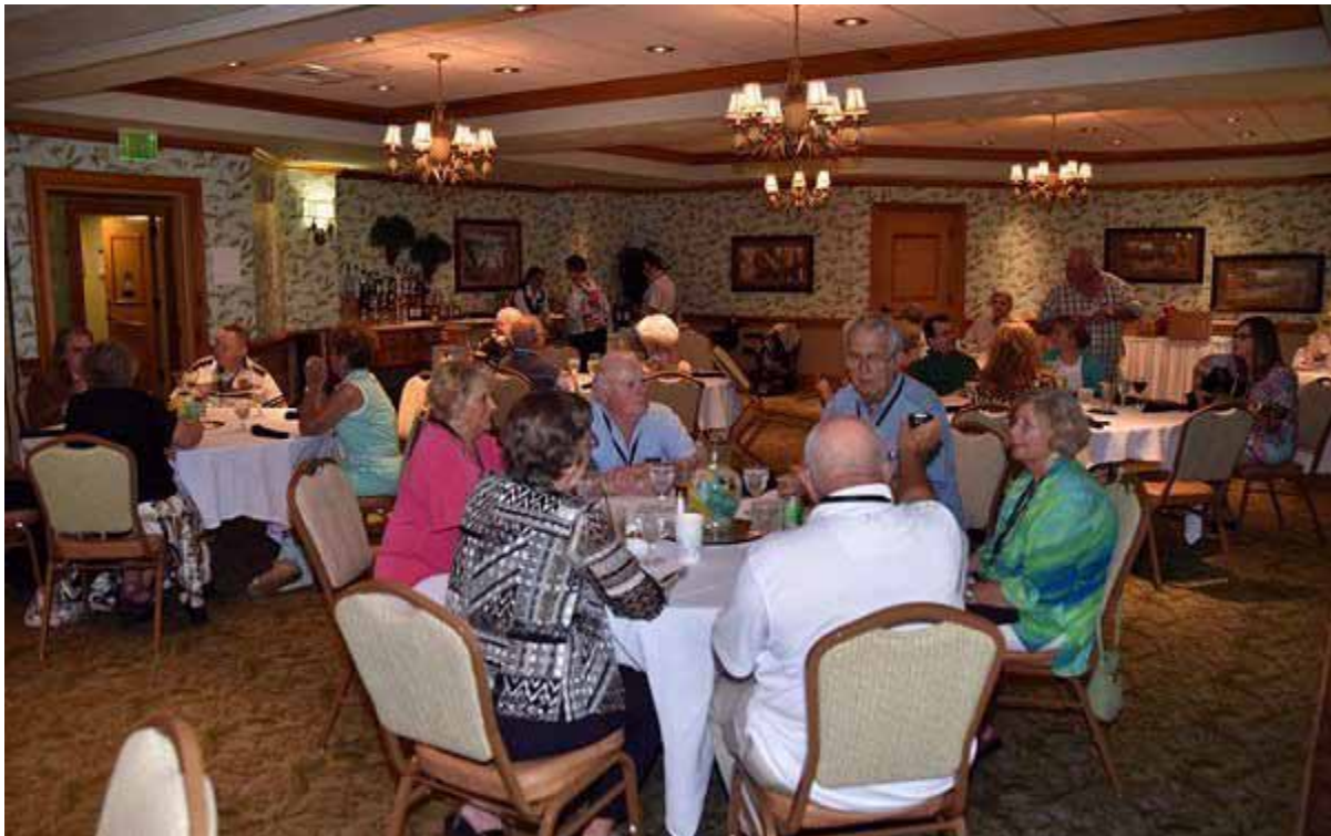
The 2015 National Convention Banquet