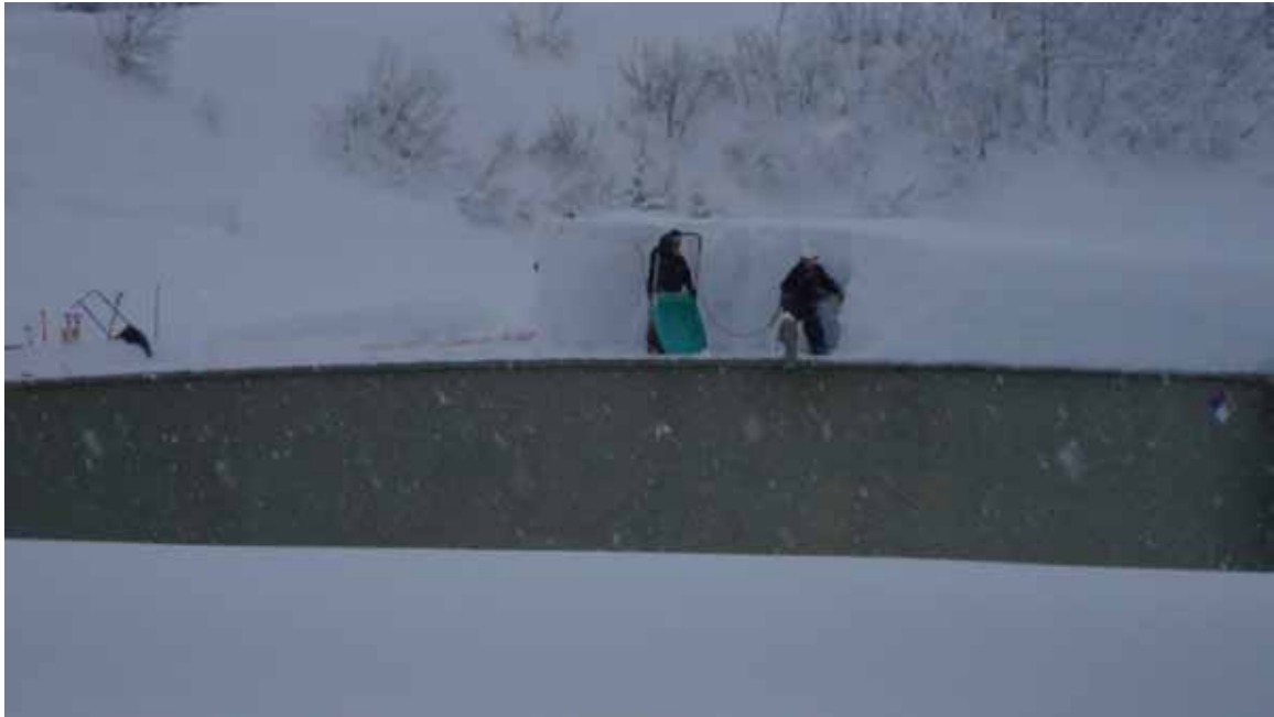
Shoveling snow off of a tank top