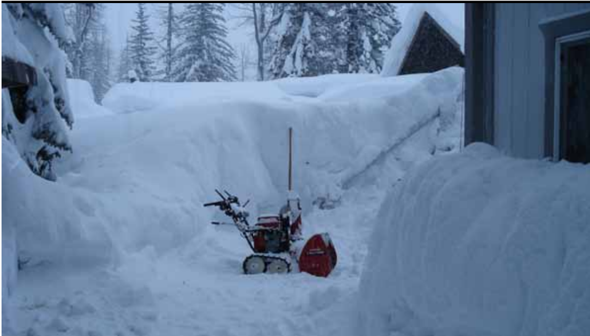
My back yard