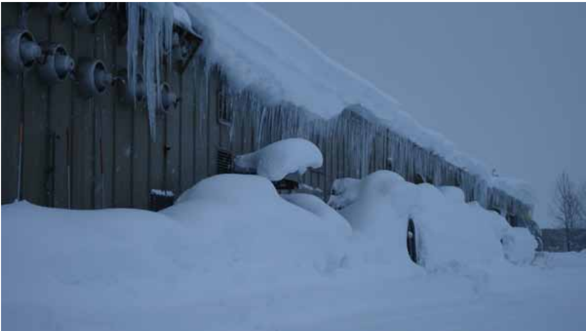
A walkway at work with someone wearing a hardhat peering out.