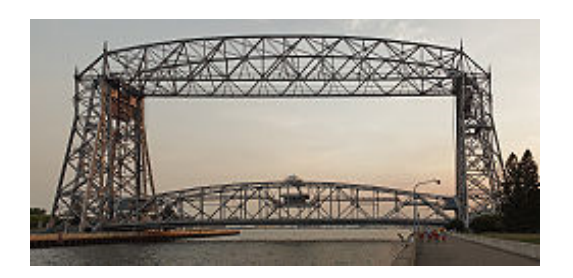
The 43<sup>RD</sup> MARAC National Convention July 6<sup>th</sup> – July 9<sup>th</sup>, 2011 Duluth, MN