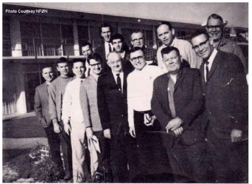
Back Row: K4ARF, WB4KGJ, WA4FAT, W5PWG, W4YWX, W5POH Front Row: K5KDG, WA4AFP, WA4LMR, K7ZJP, W5HDK, W4NXD, W0YLN, W4RMT