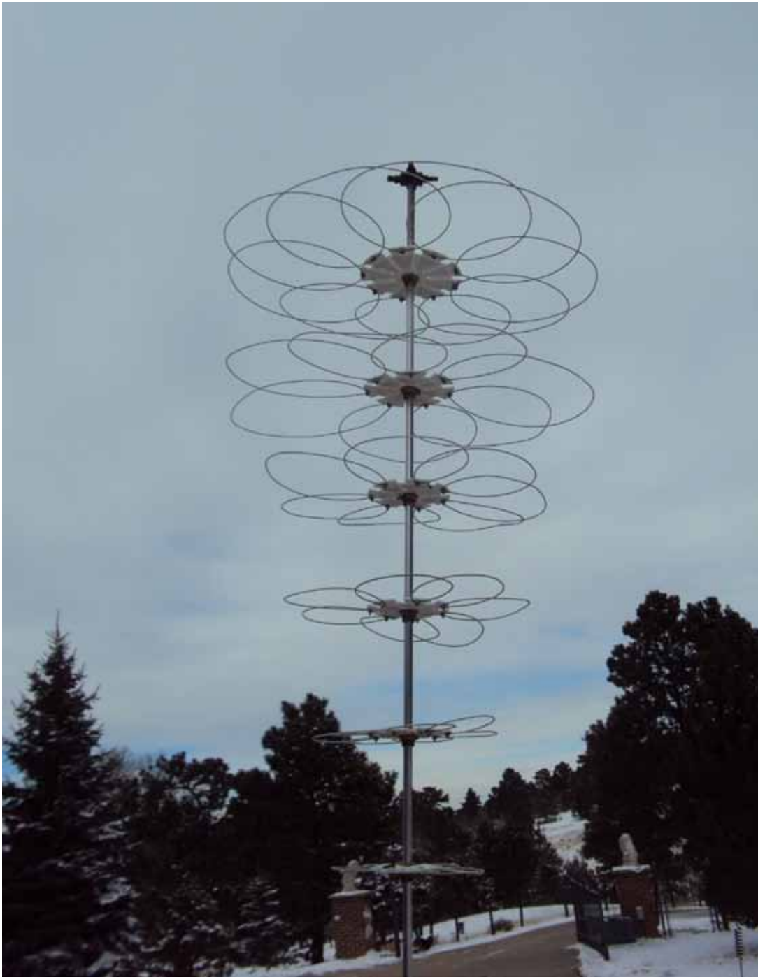
Looking back on the