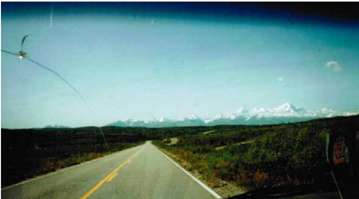
This photo is taken near the Third and Fourth District line looking at a 16,000 foot plus mountain range.

The Third and Fourth Districts are by far the easiest to run, just pick a nice spot away from one of the many mountain ranges and hope the band is open.