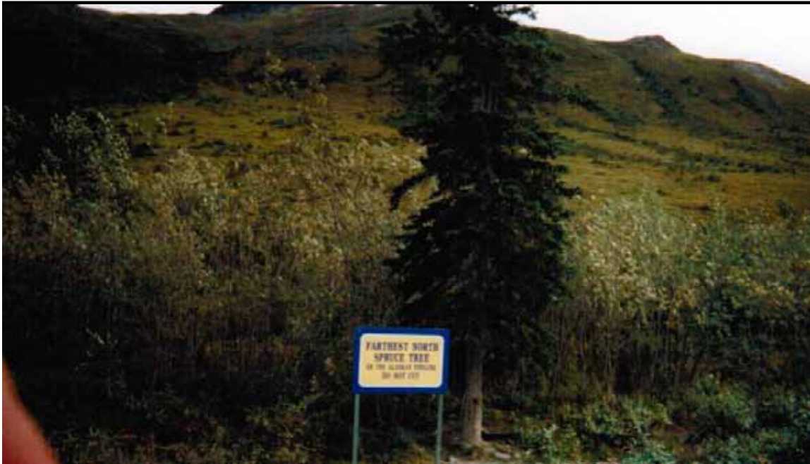
This is the furthest north spruce tree, I am not sure if it is still there - this was taken a few years ago.

As you go North you will see a sign the size of a billboard that you are entering the “North Slope Borough” this is where the Second Judicial District begins - of all the counties I have ran (all 3077) this is the largest county sign I have ever seen. This is not a good place to put out the district because it is at the bottom of Atigan Pass and surrounded by mountains. Also notice the Trans Alaska Pipeline in the distance; it is a 48 inch oil pipeline.