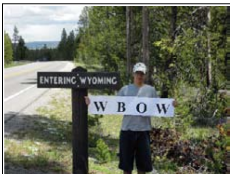
WØTOL County/State Line Gallatin, MT & Teton, WY