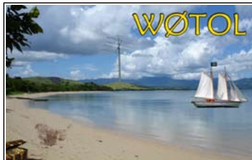
WØTOL's QSL Card