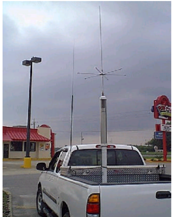
“TARHEEL SCREWDRIVER AND TOP HAT”