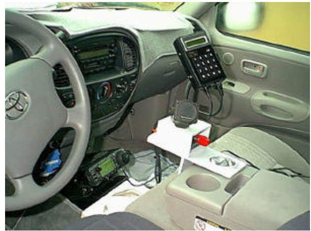
Amac Controller Installed In My Cab