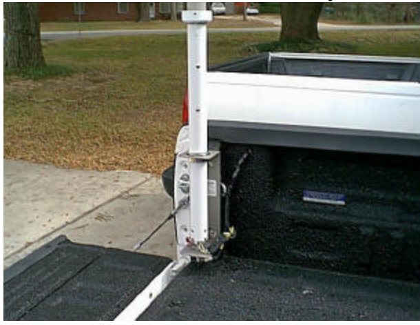
Tarheel Screwdriver Mounted On My Tundra